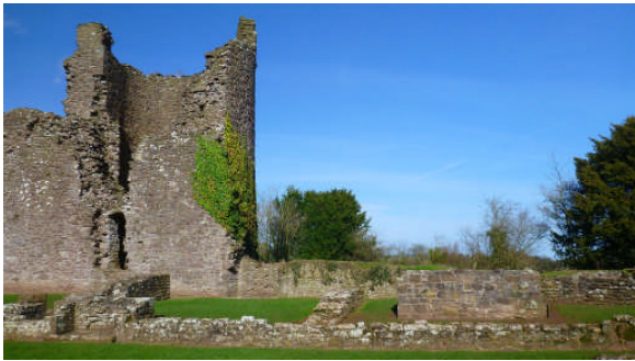
White Castle, originally named Llantilio Castle, dates from the 12 th century but probably replaces an

The narrow lane continues steadily uphill with 'Lower White Castle' and 'Middle White Castle' cottages making your progress until you reach 'Upper White Castle' at which point the short lane to the left leads to the large, moated castle.