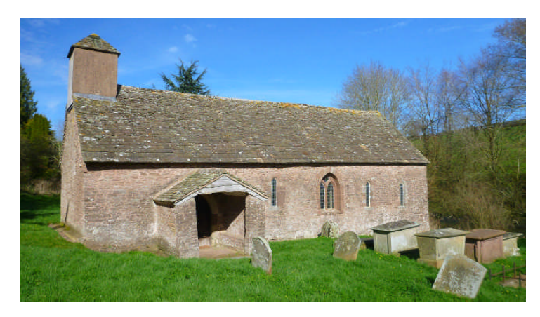
south Herefordshire's fruit-growing country at Pencoyd. Continue straight across at the next small crossroads, following the sign to Pencoyd.

This little church is an absolute gem, dates from about 1056, has a Norman font but Roman altar with a Latin inscription stating that Beccicus dedicated the altar to the god of the cross-roads. The presence of which also suggests earlier churches were likely to have been built here. Mediaeval and later wall paintings and texts are still visible on the walls. Sadly, the church is now largely redundant and hosts just one church service per year.